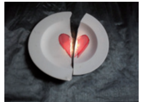
An image taken by one of the young people on the photography workshop “A broken heart”