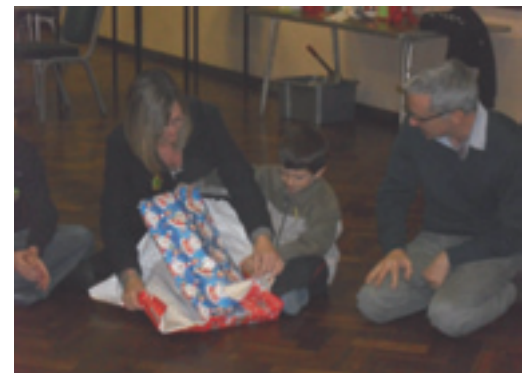
“SeeSaw helped to take your mind off it and helped you make friends with the same problem you have.”

One youngster told us “SeeSaw helped to take your mind off it and helped you make friends with the same problem you have.” Icing cookies was voted by many children as the best activity of the day!!